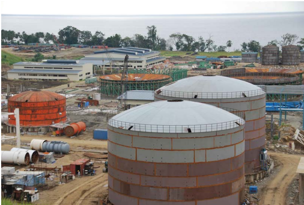
Construction at Basamuk Refinery with acid storage tanks in the foreground Ramu Nickel-Cobalt Mine-Papua New Guinea